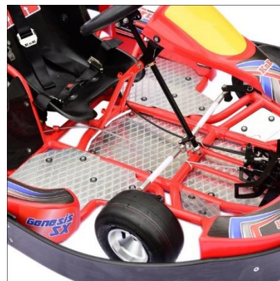
Slip Resisting Floor Pans