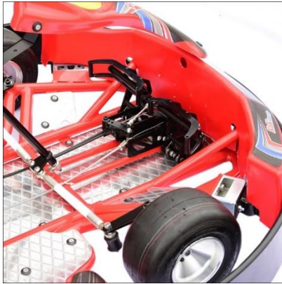
TABOO Pedal System

A strong roll hoop protects the driver who is strapped into the seat using a four-point safety harness. Other areas where the safe build is seen is with the steering mount system, the large area slip resisting aluminum floor trays, the double protection heat shield round the hot exhaust, the pivoting contoured rear axle cover, the adjustable pedal system with the popular TABOO system that over-rides the pedals and disconnects accelerator in case of panic situations when both pedals are activated simultaneously. There are other features as well, like the twin cable actuated brake caliper that permits the brakes to operate in case one cable should fail.