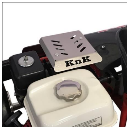
Exhaust Heat Shield,

An almost indestructible polymer guardrail system is mounted on a floating platform that isolates it completely by providing an integral shock absorption system that dissipates impact energy through "progressively decelerating" the energy from impacts by using compression and elongation of specially formulated energy isolators located between the chassis and the guardrail around the entire kart. Excessive energy from abnormally high impacts, though rare, are taken care of by specially designed, replaceable, "self sacrificial" crumple sections fitted to the chassis at the zones that are prone to receiving the highest impacts. Replaceable crumple zones is a first in the karting industry.