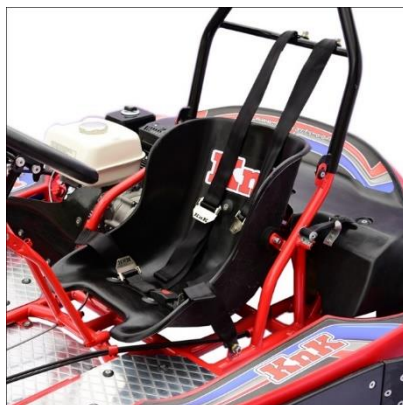
Roll Hoop & Seat Belt

Also available with floor mounted fuel tank